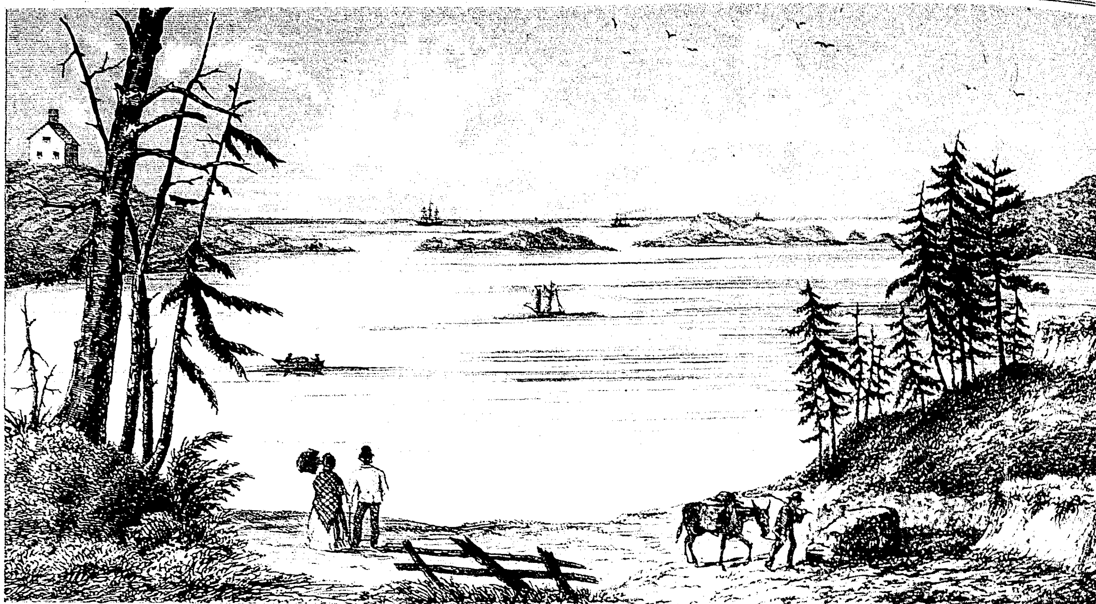
PORT OF LOUISBOURG, CAPE BRETON