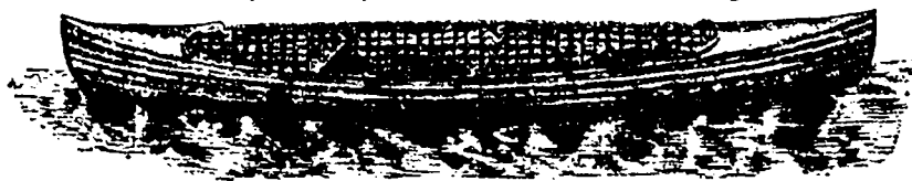
PATENT LONGITUDINAL RIB CANOE.

Patent Cedar Rib Canoes, Patent Longitudinal Rib Canoes, Basswood Canoes, Folding Canoes, Paddles, Oars, Tents, and all Canoe Fittings.