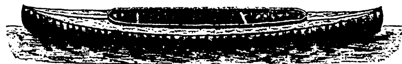
THE JUNIPER CANOE.

Gold Medal, London Fisheries Exhibition, 1883.