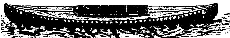
THE ONTARIO CANOE.