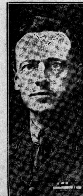
Some will remember the stout Guinness made. Here is his son, the Hon. Walter Guinness, who has recently been advanced from the post of under-secretary of state of war to financial secretary of the treasury