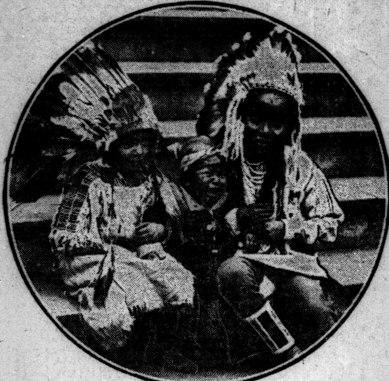
On their first visit to New York, these three little members of the Flathead Indian Tribe of Montana found the Great Paleface City a rather lonely place—and the smallest one in the group simply cried his displeasure