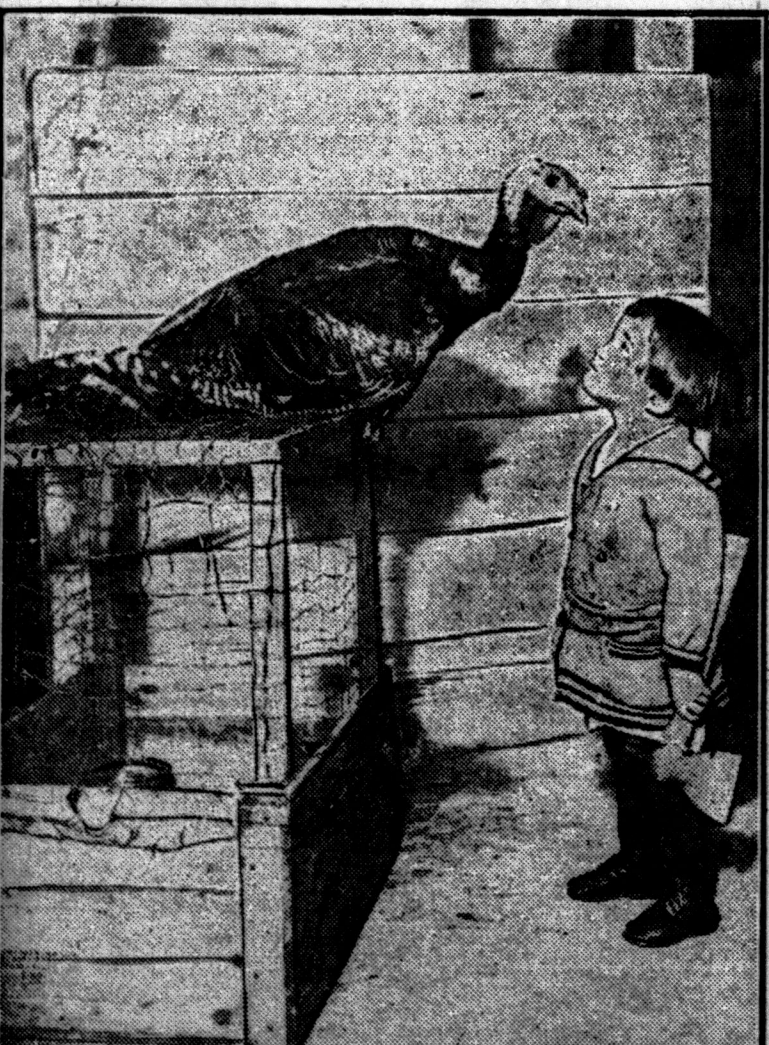
Are we feeding up our turkeys for Thanksgiving? This little chap has done so and now he is after his neck—the gobbler's. He is seen looking longingly at the bird for the last time