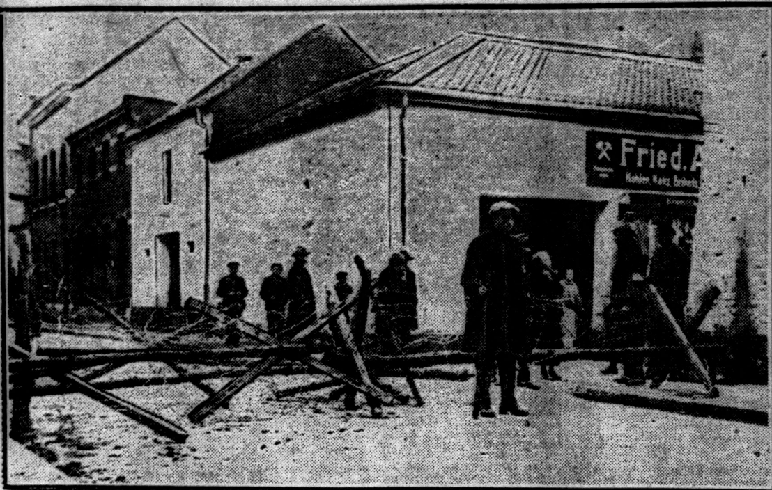
The streets of Crefeld, near Dusseldorf, in the Rhineland area, were barricaded with barbed wire entanglements against the southern separatist army following the Rhineland's decision to become a union by themselves