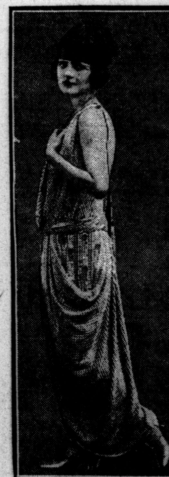
This evening gown is made of butterfly velvet voile featuring effective draping. The skirt is long and full and there is a narrow panel in the back reaching below the hips