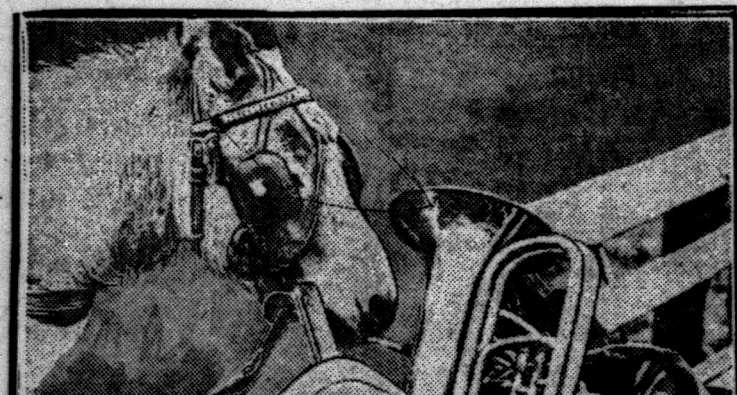
Who ever heard of a musical mule? This one doesn't blow his own horn, but takes great delight in blowing the instrument of a bandsman who is taking a rest in a London park