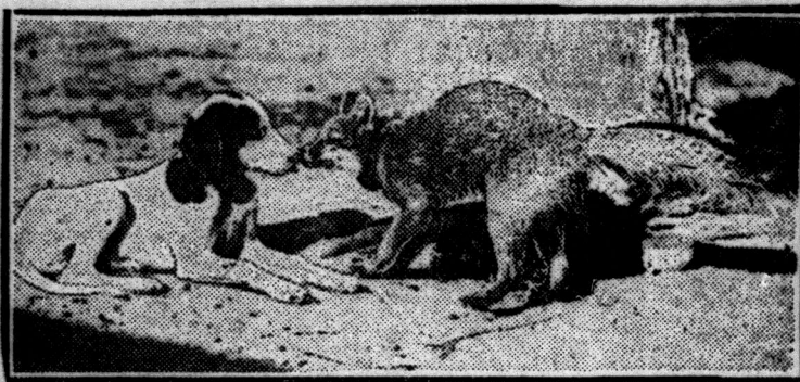
Fox and foxhound in an unusual role — sweethearts. They were raised together from puppyhood. Now they occupy the same sleeping quarters, eat from the same dish and are affectionate pals