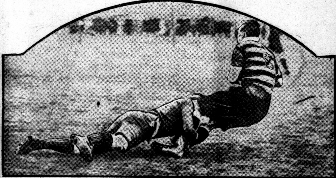
The London Scottish have not only distinguished themselves as soldiers, but as rugby players of no mean ability. The photograph shows one of the London Scottish bringing down a Blackheath player in a recent match