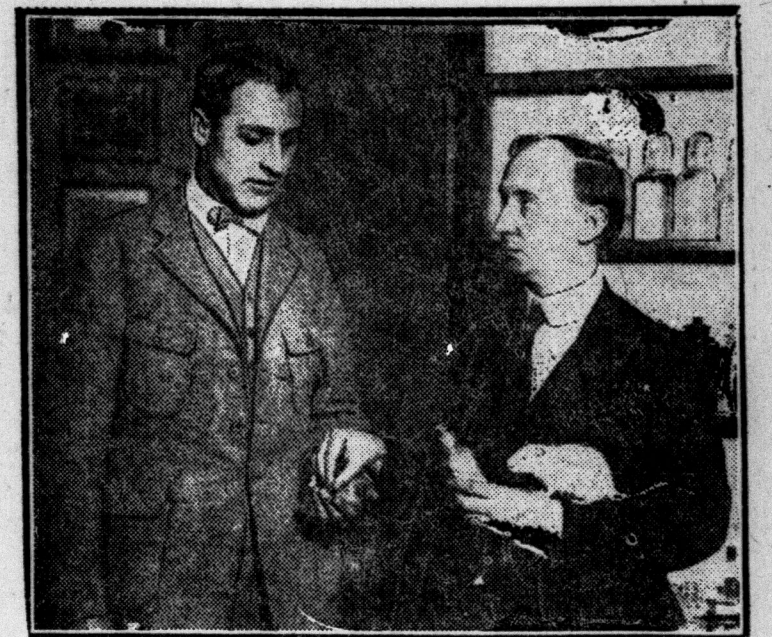
This student at a Philadelphia medical college has just been administered one of the mysterious pills of drug "x". He is living a "perfect life" in order to find its results and reactions. The white mouse got one too