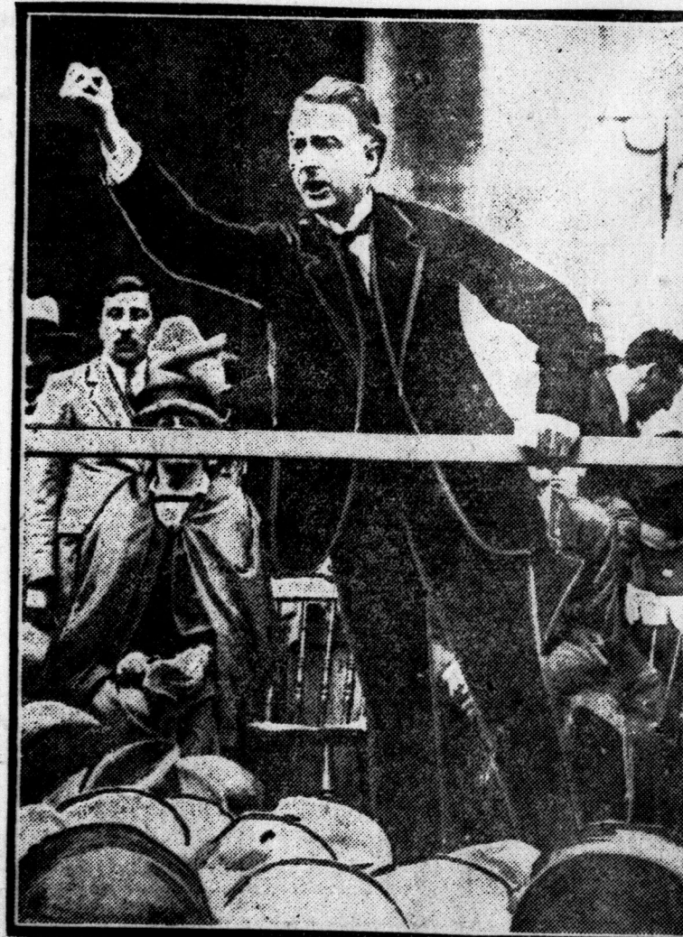
Here is a striking picture of President Cosgrave of Ireland in a striking pose. He is seen addressing a crowd at the College Green, Dublin, prior to the elections.