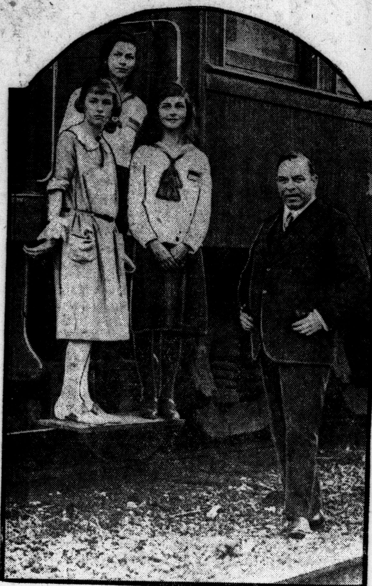
Premier King made many new friends during his recent visit to North York. He is seen previous to his return to Ottawa.