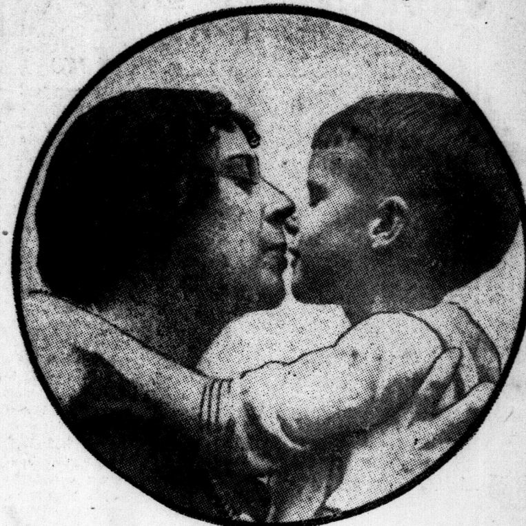
Anna Nichols, author and producer of "Abie's Irish Rose," says good-bye to her son before sailing for London to superintend a stage presentation there.