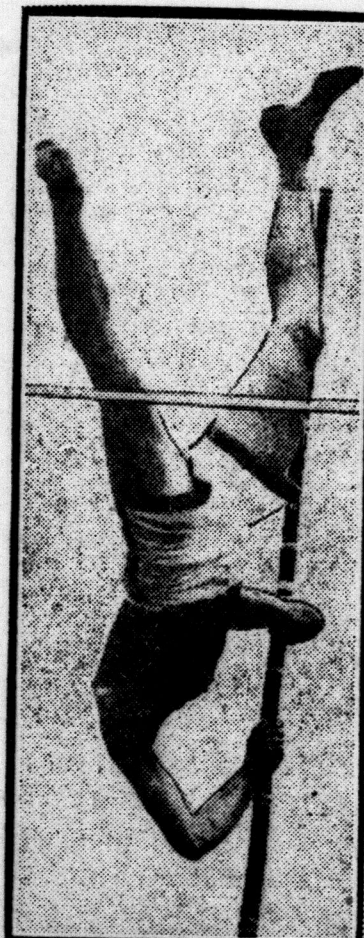
A Yale man about to clear the bar in the pole vault at the inter-varsity sports at Wembley stadium.