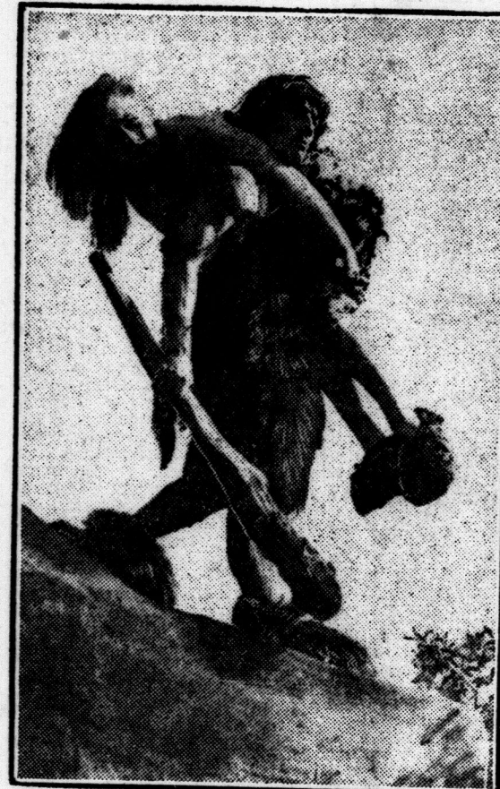
Here's a real live cave man who uses Loch-invariant stunts to capture his bride. Do you recognize these faces of the movie world?