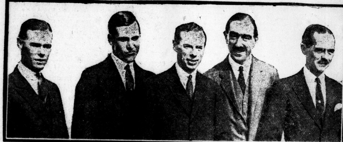
The British army polo team have arrived in the United States to compete in the international military polo championship.