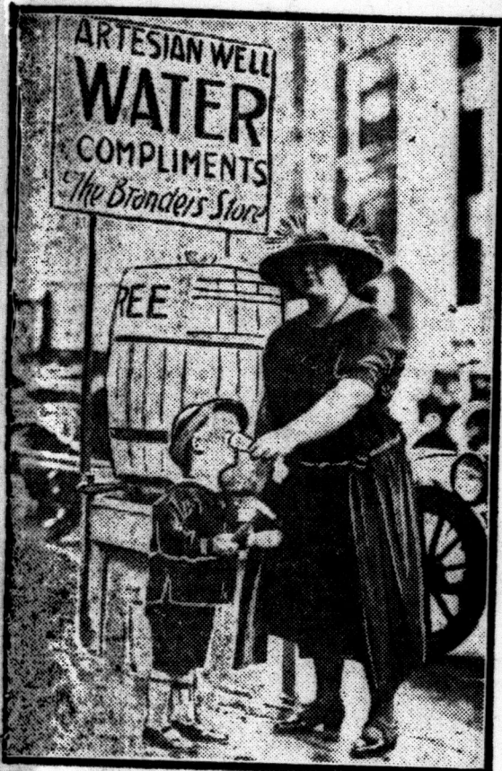
Omaha, Nebraska, is slowly recovering from a crippled water system caused when the mud banks on the Missouri were carried away near the intake of the city water system.