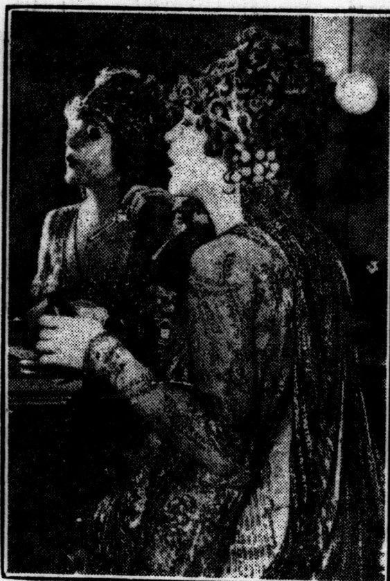
Mae Murray administers some delicately fragrant French perfume prior to taking a scene for her latest picture.