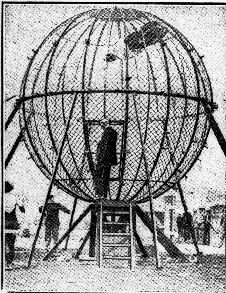
This motorcyclist defies the law of gravitation as he spins around the huge steel ball before the grand stand at the Canadian National Exhibition.