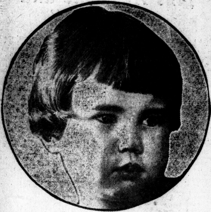
Baby Peggy has just signed a contract that will ensure her at least $1,500,000 a year for the next three years for her share in the movies.