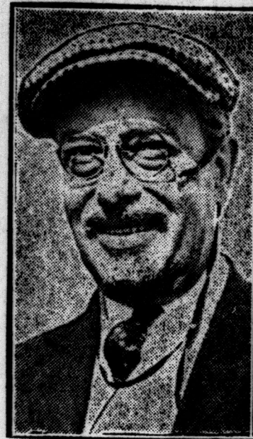
George W. Peck, the original and only "Peck's Bad Boy," as he is to-day. It was his escapades as a boy that gave material for a book.