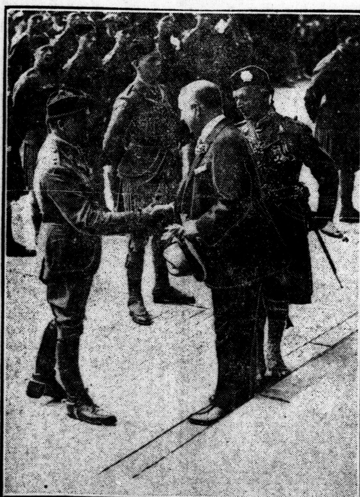
Detachment of London Scottish, now in Toronto as guests of the Canadian National Exhibition, are seen being welcomed to the city by Mayor Maguire.