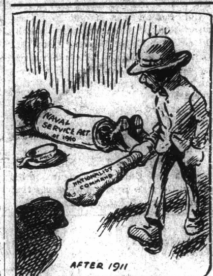
So much for Navy Bill-

indiscretions. Fof instance, there are the Nation alists with whom the Conservative party formed a league in 1909 to divide Quebec and defeat Laurier. The gospel of the Nationalists in 1911 was that the Naval Service Act was a thinly veiled plan of England's to drag Canadians from their homes, and send them as cannon meat to the seven seas. Of course one of the objects of that act was to enable us to defend our own shores and make it largely unnecessary to send Cana-dian armies to Europe to defend our