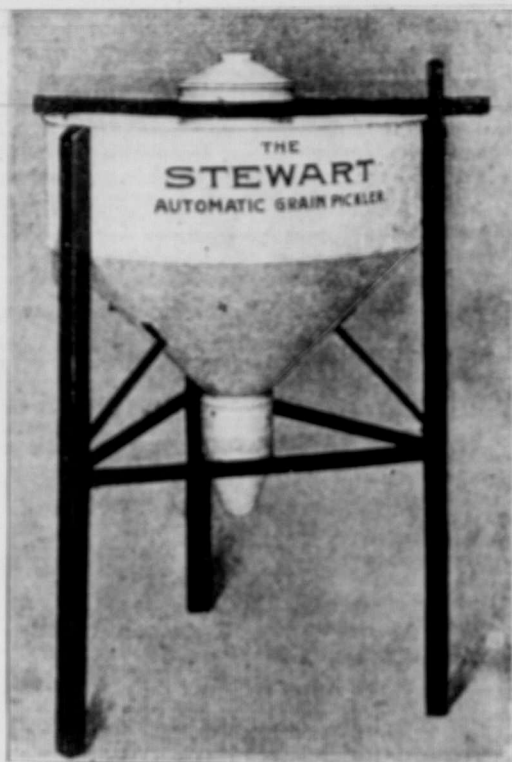
Our Automatic Grain Pickler