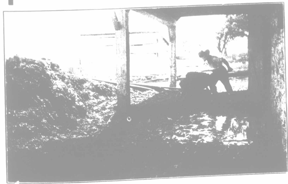
Hard Work and a Filthy Barnyard