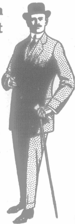
$13.25, Duty and Carriage Paid

If you don't want to cut this paper, mention the "Advocate" when you write.