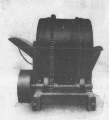
Note Low Feed and High Discharge.