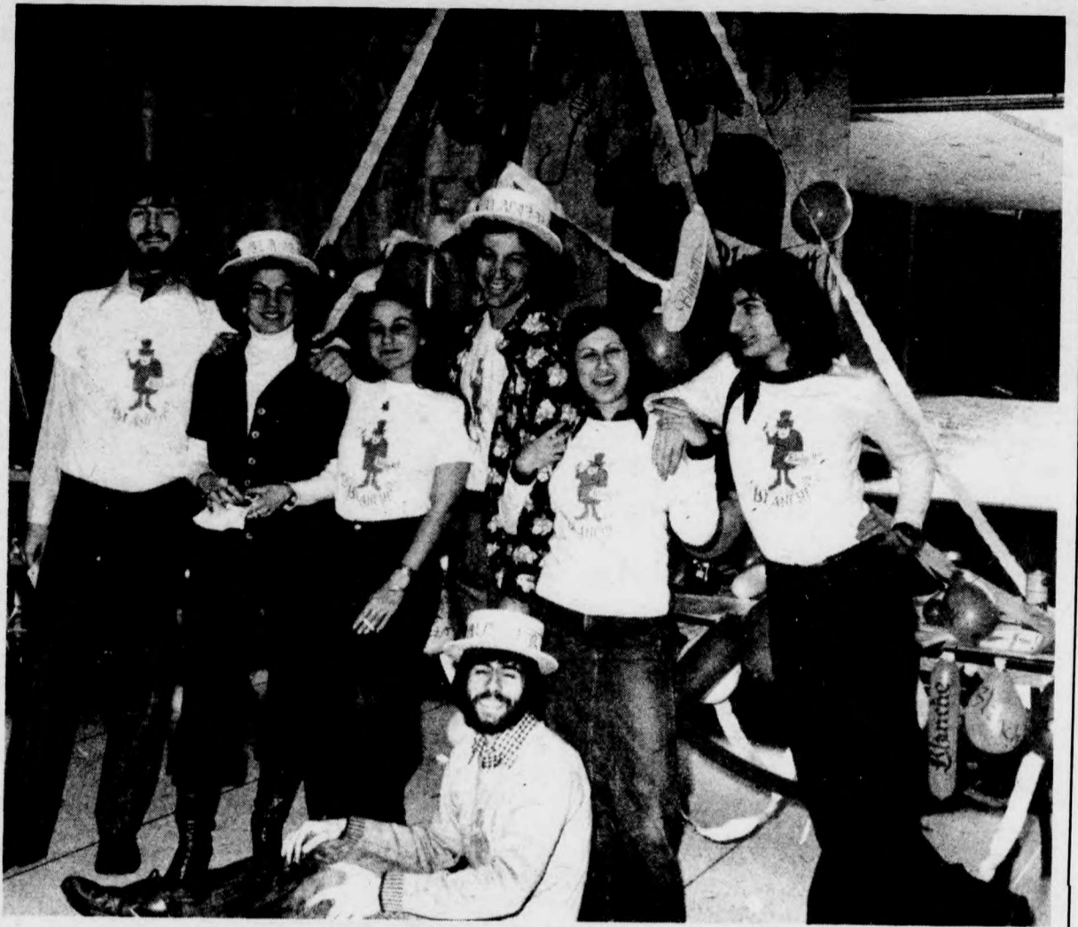
The Blanche Blödgett Team winding up a successful campaign.