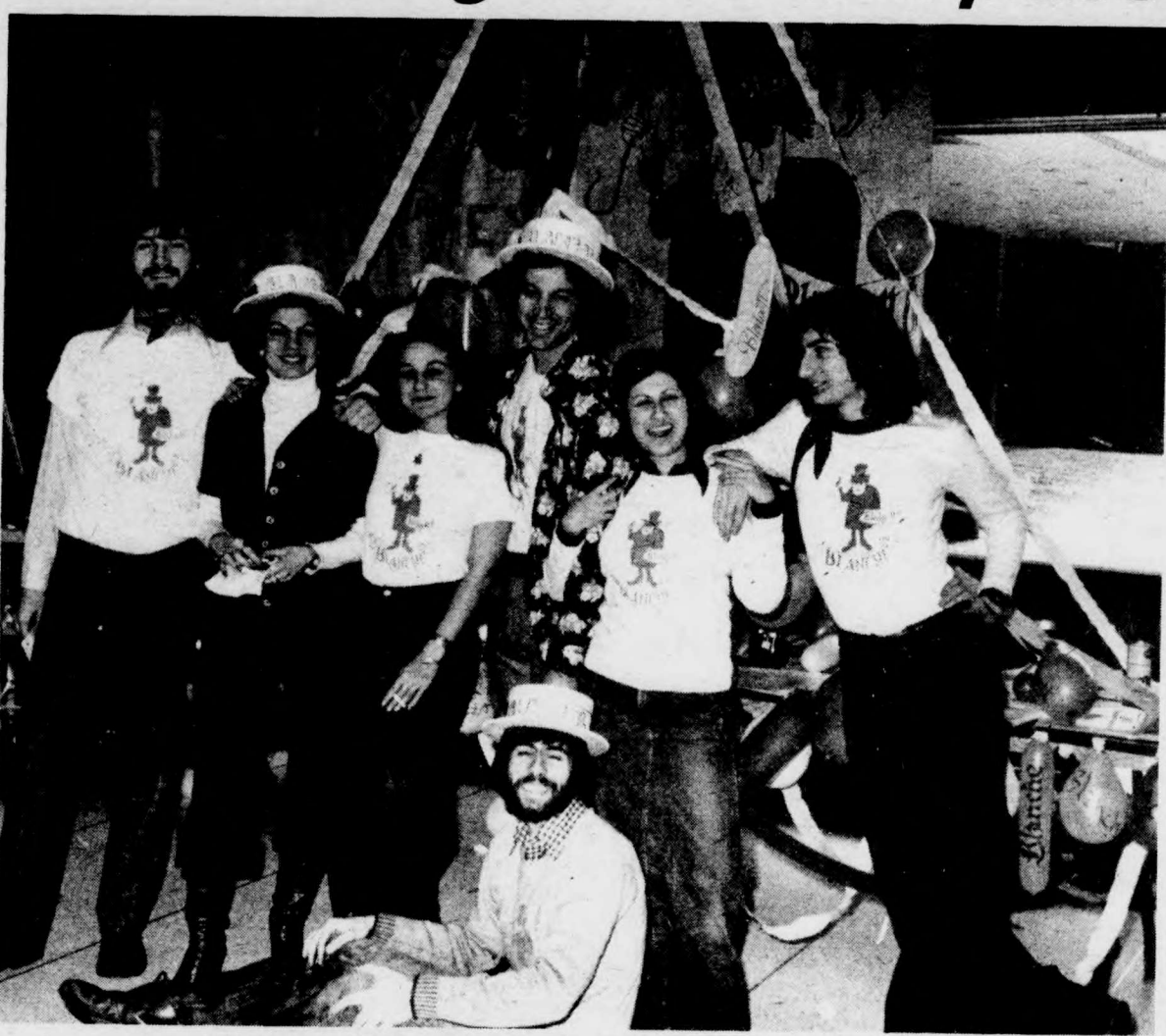
The Blanche Blödgett Team winding up a successful campaign.