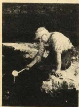
Our own iron-free water

AT THE JACK DANIEL DISTILLERY, we have everything we need to make our whiskey uncommonly smooth.