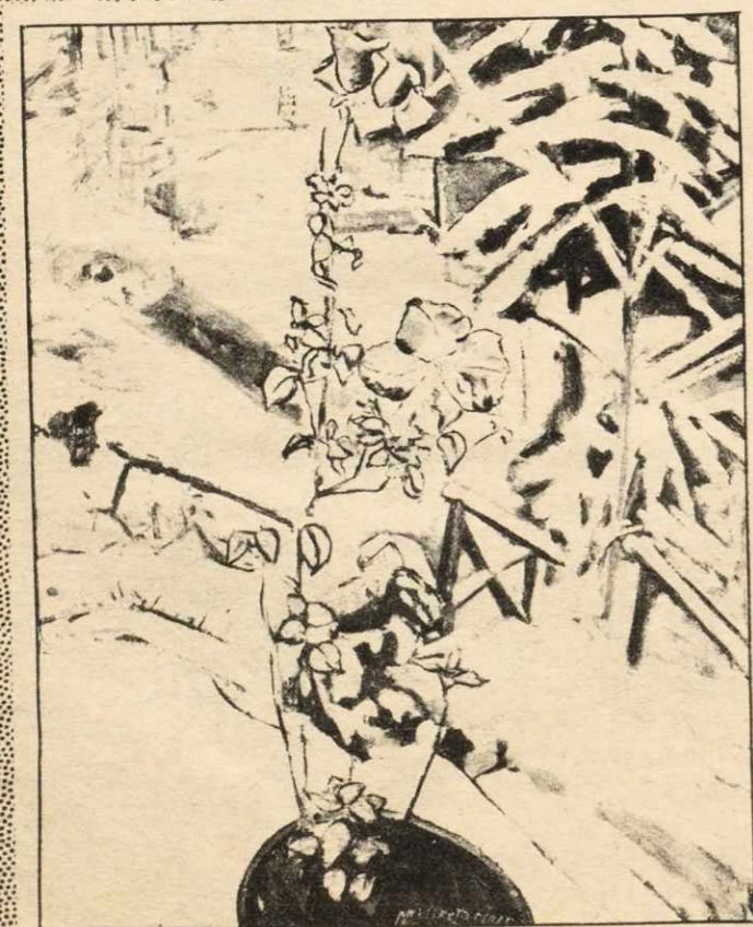
Clematis Flower 1951