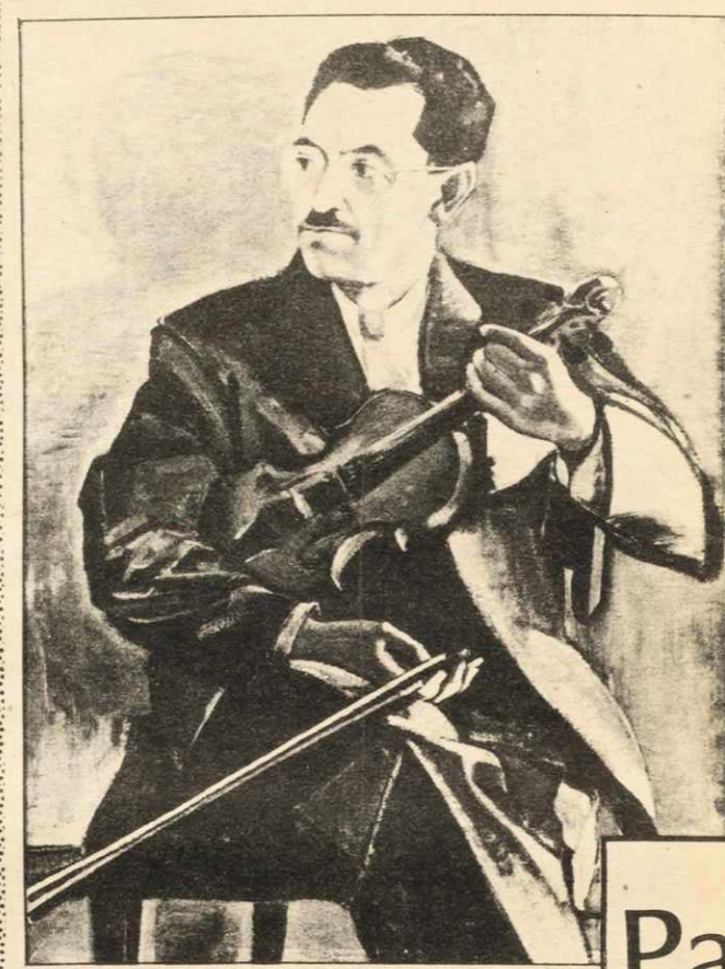
Portrait of Murray Adaskin 1944-45