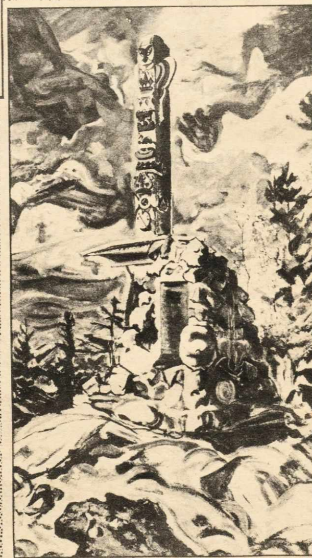
Tom Thompson Memorial Above Canoe Lake 1951