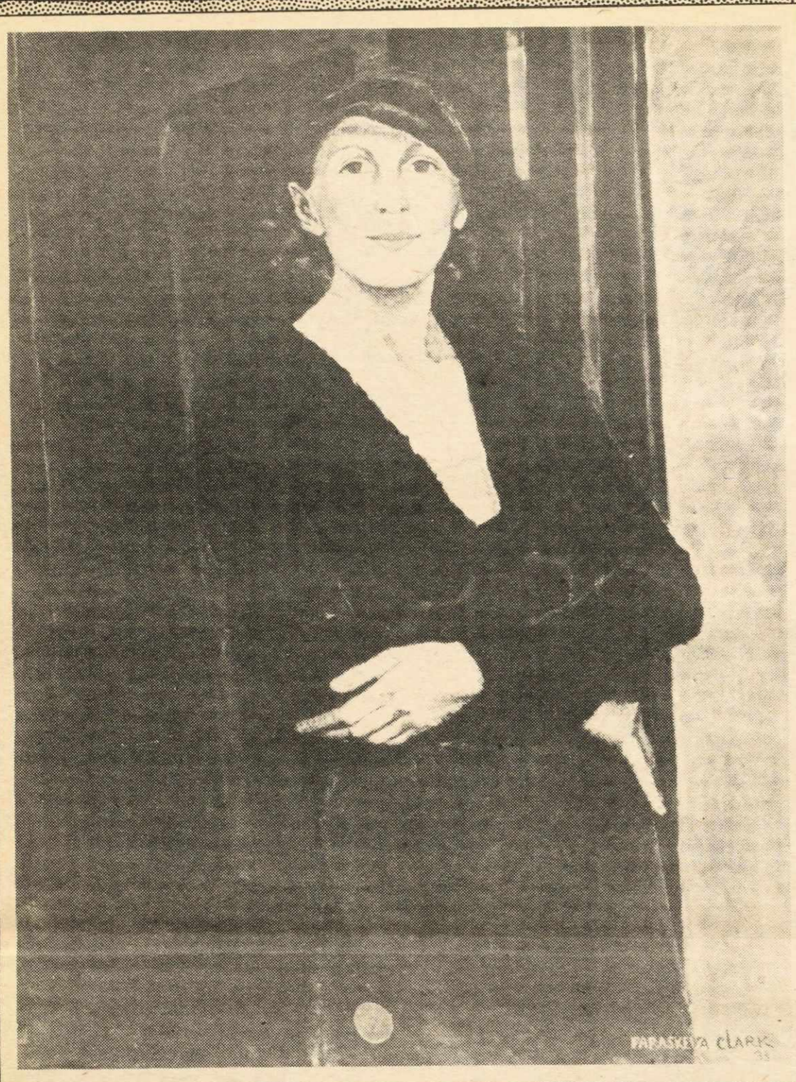
Self Portrait 1933