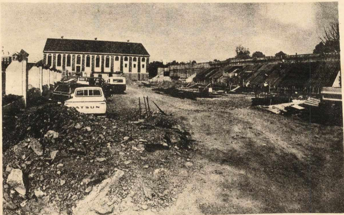
The new Dal rink is now under construction after a fire that demolished the old one in May, 1979