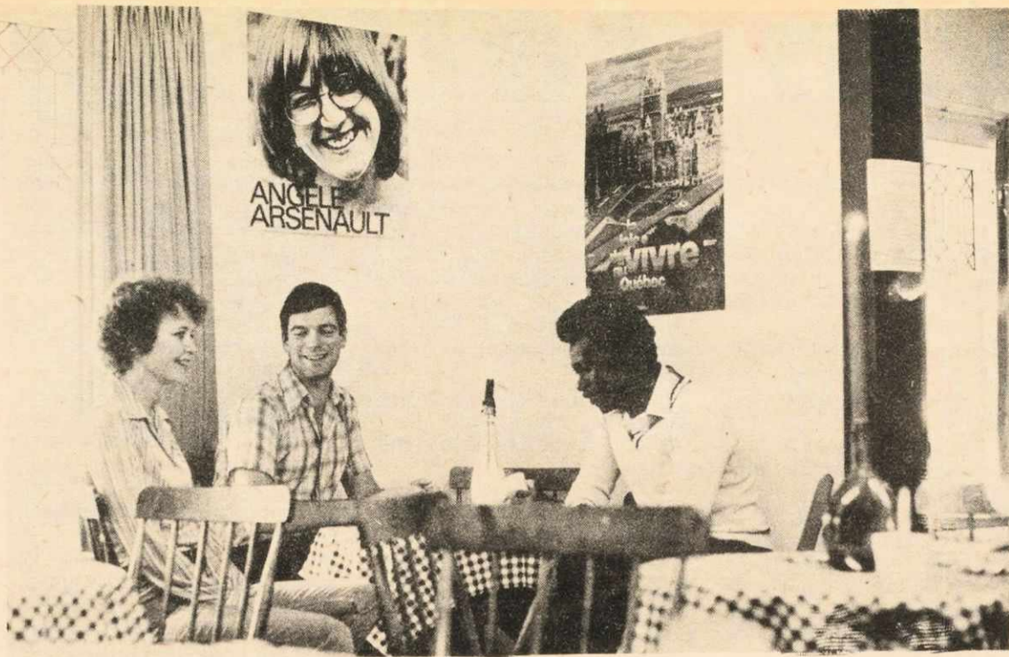
Parlez-vous francais? The French cafe on 1139 LeMarchant Street opened with a bang on Tuesday.