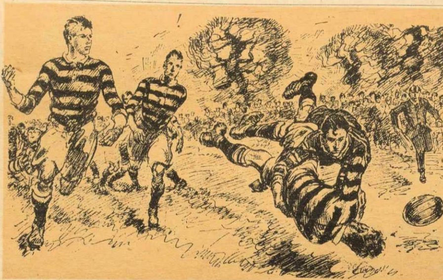
These students did not come to Dalhousie because they were offered money to play on a team.