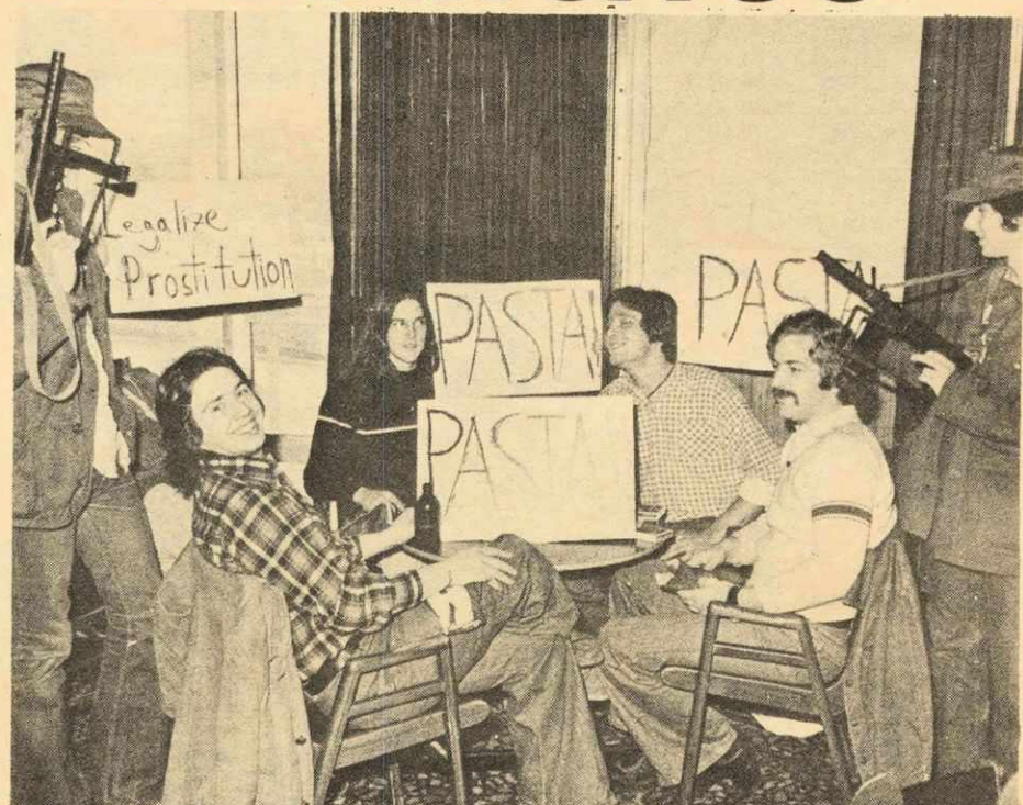
People of ST. Marchos know how to celebrate independance!!

That same day thousands of happy citizens held celebrations in small villages throughout the countryside. Thousands of baseball cards were burned. That night is was reported that many comrades in the spirit of true socialism went out to paint their towns red.