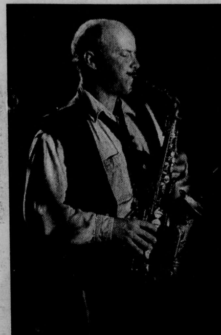
Sax at Opening Night gala

The blues are in your face and driving — when many people think of the blues, the first instrument they think of the harp is itself. It has a vocal quality similar to a baby's cry ... (and) it is the next thing from a human voice people relate to. As for the blues themselves, it's really in all of us. It's a throwaway line, but it's true."