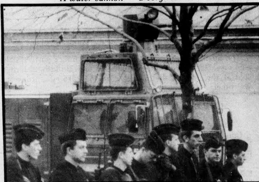
French police gather in front of the watchful eye of a water cannon on a Paris street