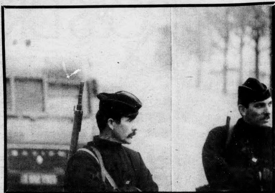
Two gendarmes exemplify the concern over the potential violence during student demonstrations