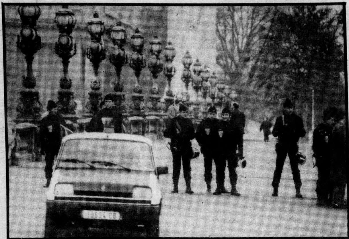
Forever "en garde", Gendarmes observe student protests on a major route in Paris