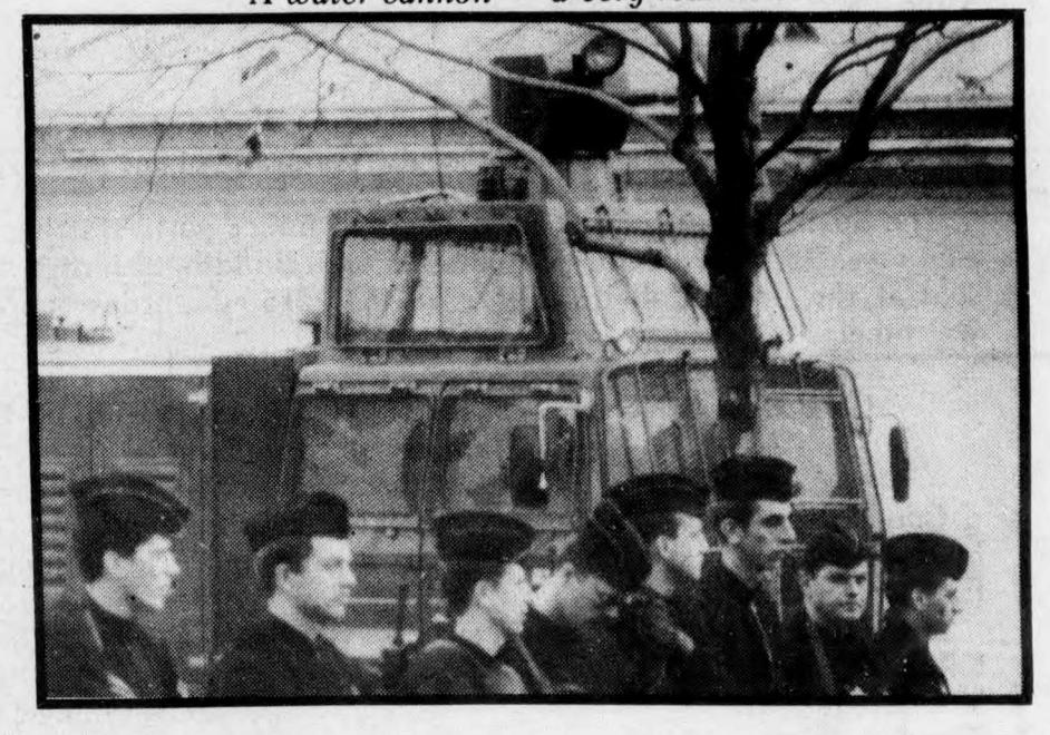
French police gather in front of the watchful eye of a water cannon on a Paris street