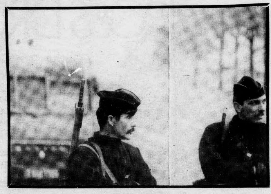
Two gendarmes exemplify the concern over the potential violence during student demonstrations