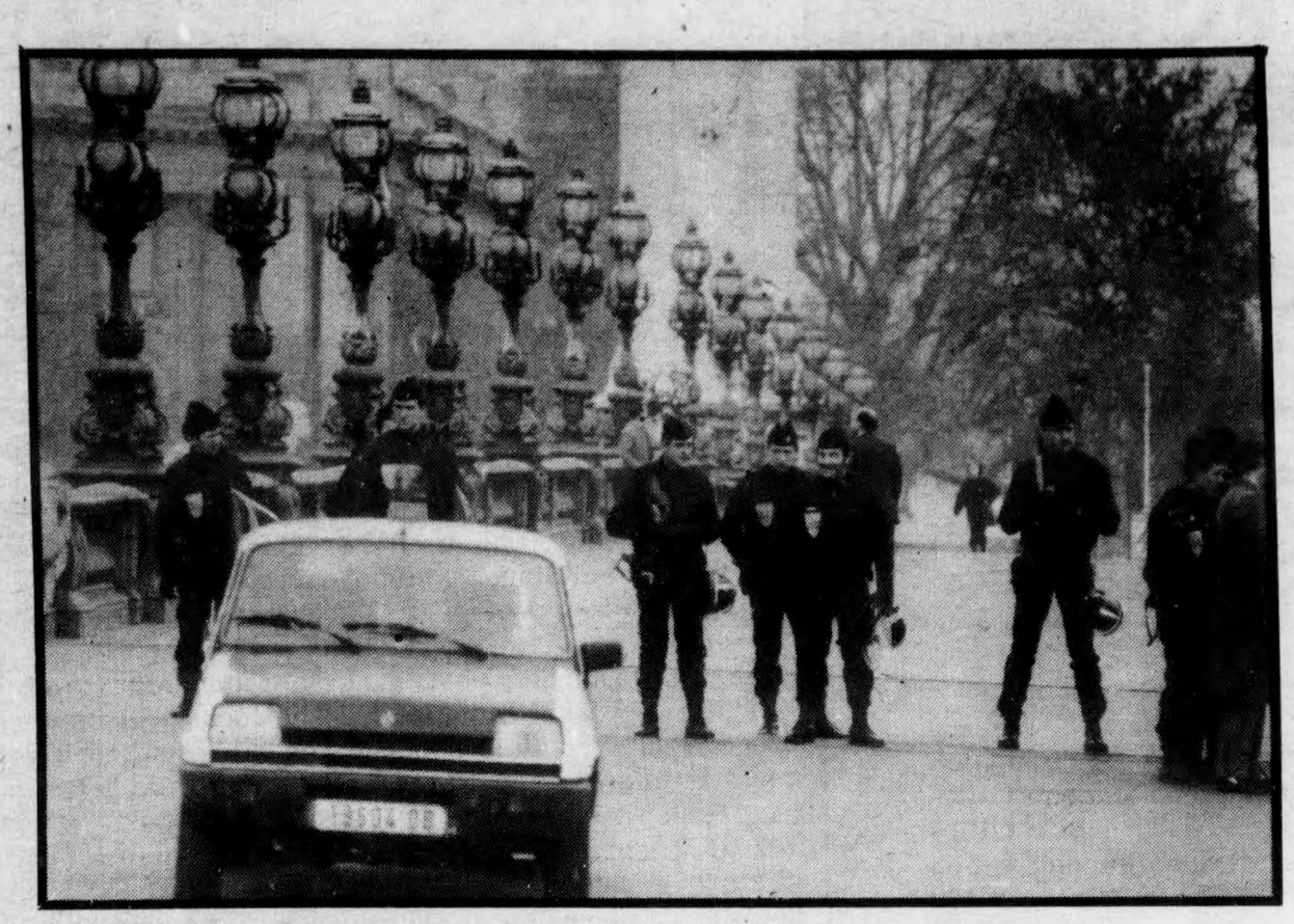
Forever "en garde", Gendarmes observe student protests on a major route in Paris