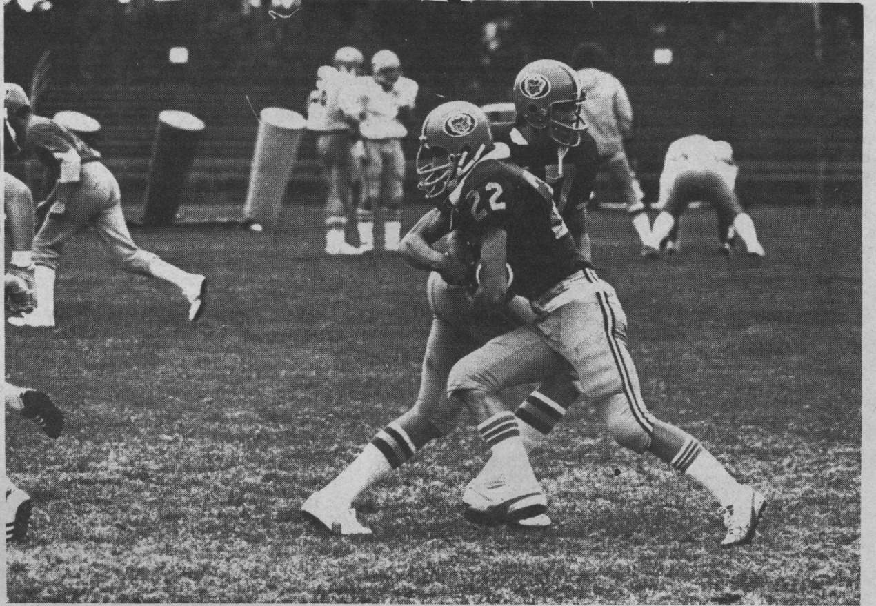
Bears line up in preparation for Saturday's game against the always physical Bisons.