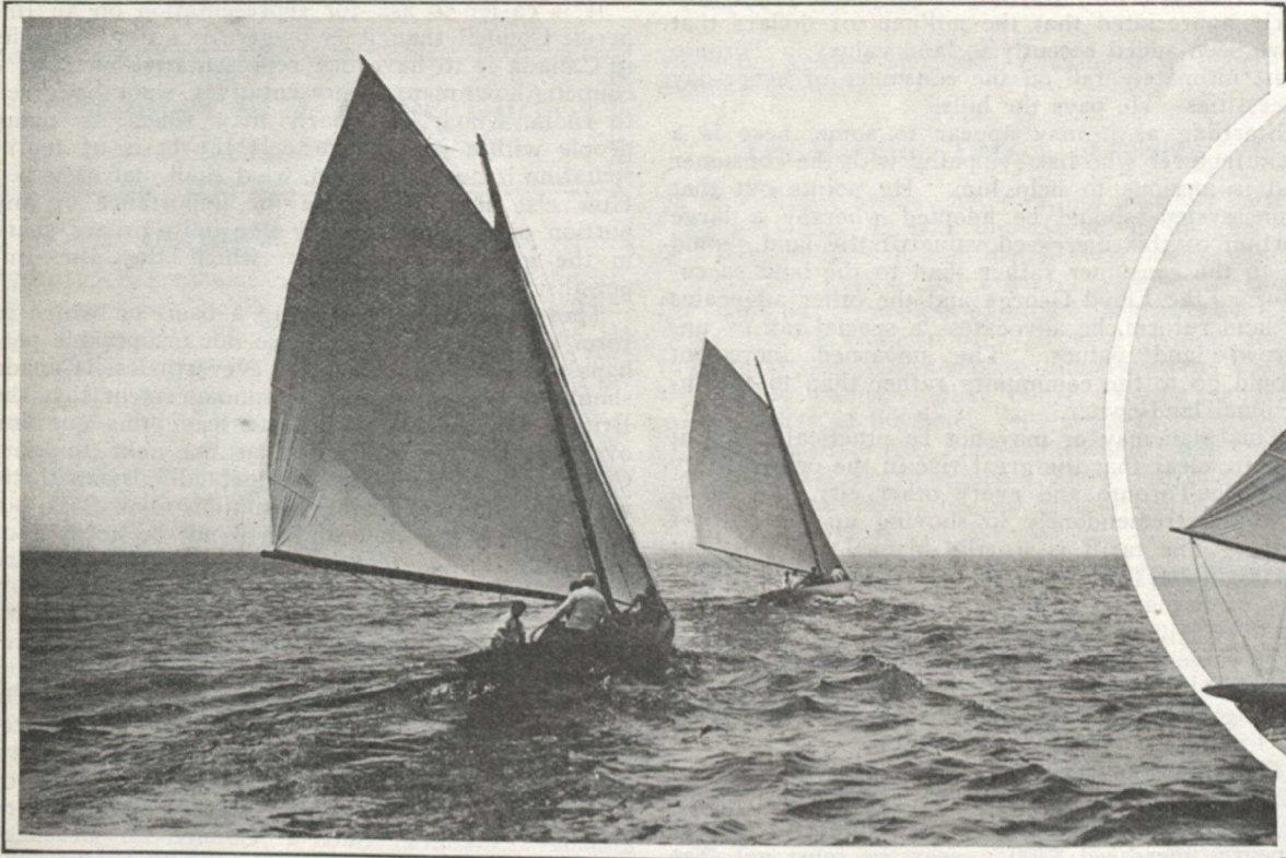
The "George Cup" Remains in Toronto. It was Successfully Defended by the Nirwana, R. C. Y. C., Against the Challenger "Watertown" of Watertown, N. Y. The Score was 4 to 2, but the Nirwana Won Two Straight Heats.