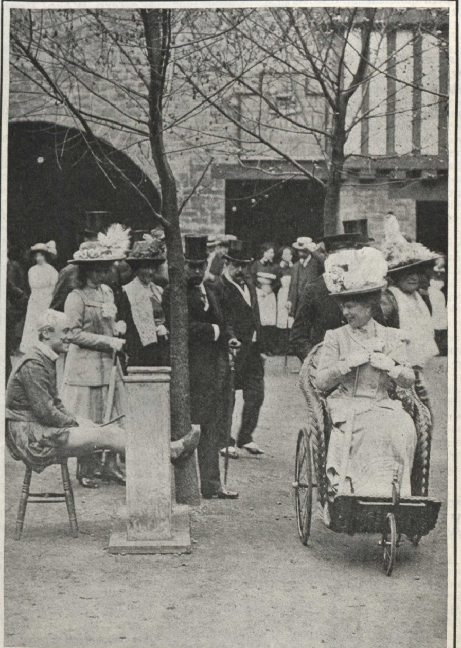
The Persistent Photographer is Sometimes Lucky. Here is a Picture Taken a Few Days Ago When the Royal Party Visited Earl's Court, London's Chief Amusement Feature, Where the Glories of Old England Are Reproduced. The Charm of it Lies in the Queen's Smile, and She is More Often Serious. The Man in the Stocks is Smiling. Apparently Her Majesty and This Lowly Employee Have Had a Joke Which He Will not Soon Forget.