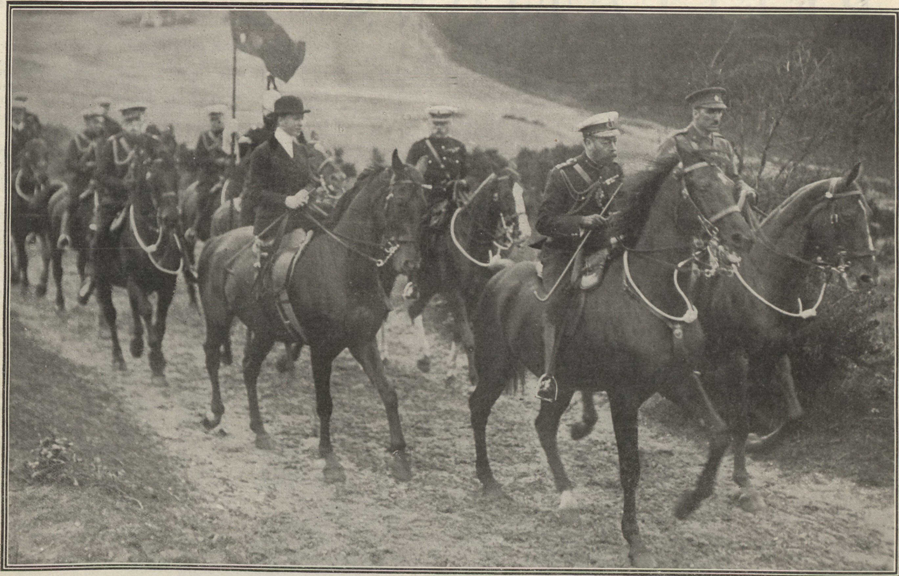
Princess Mary is Apparently not so Devoted to Dolls and Fancy Work as Some May Think. She has Begun to Take on the Special Duties of a British Princess. Here she is Riding with her Royal Parent and Staff on Their Way to the Cavalry Barracks.