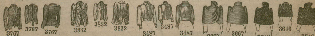
Misses' Jacket (Copyright): 7 sizes. Ages, 10 to 16 years. Any size, 1s. or 25 cts.