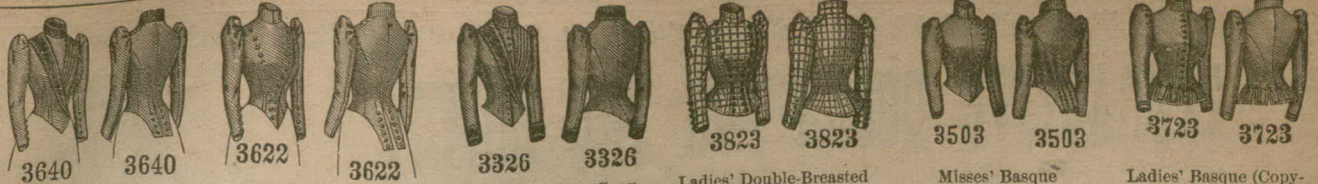
3640 3640 Ladies' Basque (Copyright): 13 sizes. Bust meas., 28 to 46 ins. Any size, 1s. 3d. or 30 cts.