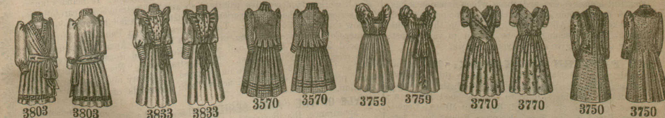
Girls' Dress (Copyright): 8 sizes. Ages, 5 to 12 years. Any size, 1s. or 25 cts.