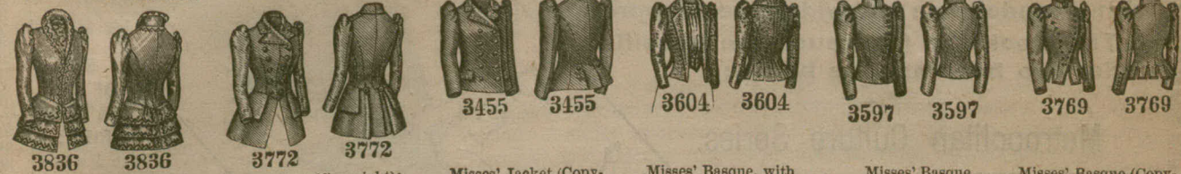
3836 3836 Ladies' Basque (Copyright): 13 sizes. Bust meas., 28 to 46 ins. Any size, 1s. 3d. or 30 cts.