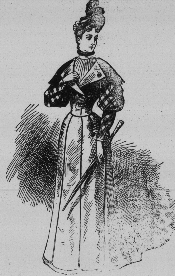
PALE GREY AND BLACK.

I'm sure you want a real pretty, cheap, rain hat, one that will stand almost anything, and yet one that will not look shabby and ugly if the rain you started out in should happen to suddenly cease and the sun should shine out brightly before you reached home. This sort of thing happens very often, even these winter days.