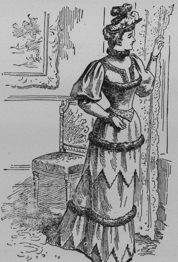
AFTERNOON TOLLIT IN CLOTH AND FUR.

Have you seen the new miniature pelerine? They call it pelerine in Paris,