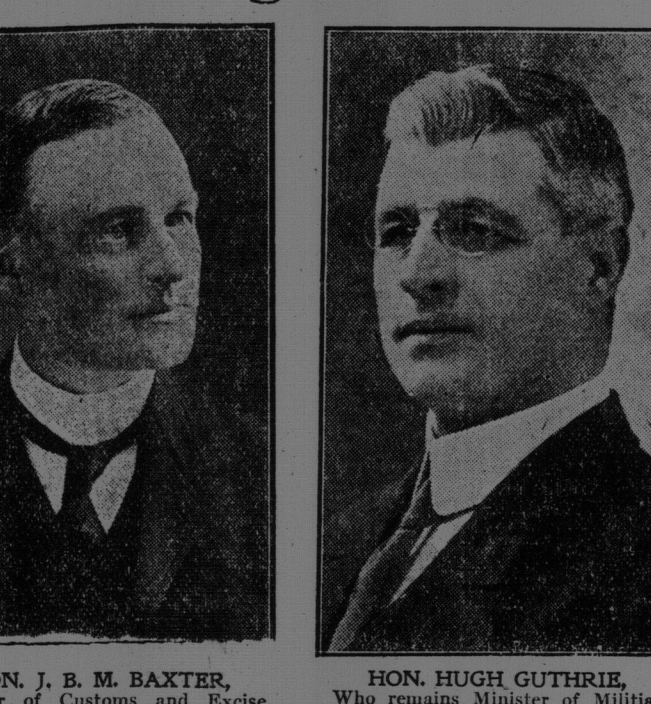
HON. J. B. M. BAXTER, inister of Customs and Excise.