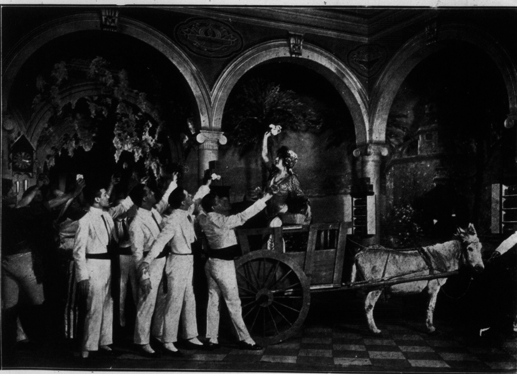
SCENE FROM "HAVANA," AT THE ROYAL ALEXANDRA THIS WEEK.

FORD'S 83 King St., West PHONE MAIN 536.