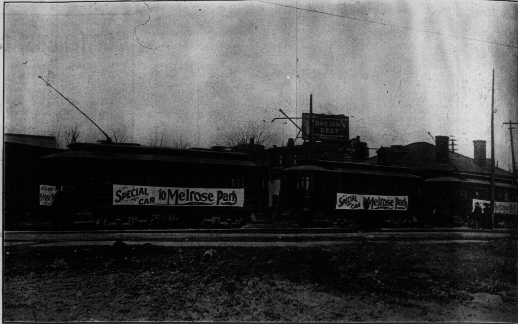
ROBINS LIMITED special cars which carried purchasers to Melrose Park on Saturday, March 19th, the opening day of this beautiful residential property