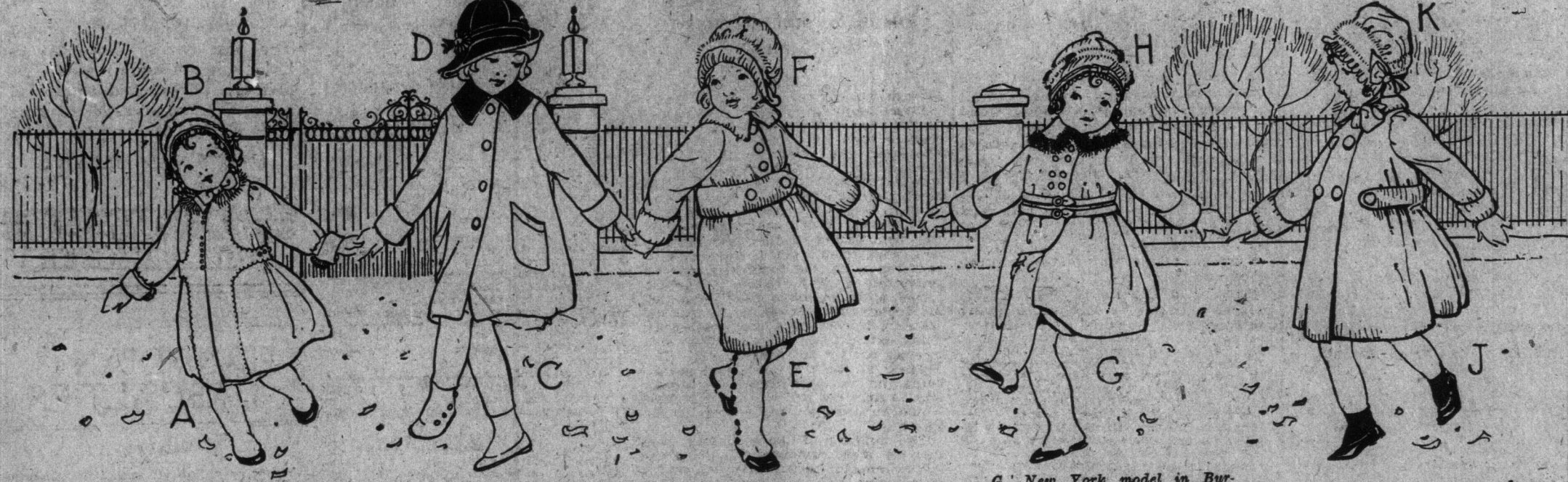
A. New York model in pastel pink broadcloth, collar of beaver fur, lined with white silk, and warmly interlined. Price, $27.00. B. Bonnet of ivory corded silk, the little shirred rosettes centred with pink rosebuds. Sizes infants' to three years. Price, $5.75. C. Sturdy reefer coat of Oxford grey chinchilla, with collar of black velvet; strap across the back, which shows tucks at the waist in "pinch-back" style—lined with black and white check. Sizes 3 to 6 years. Price, $6.75. D. Hat of black plush, the brim faced with Faddy green silk or with the black plush. Sizes 3 to 6 years. Price, $3.00. E. Coat of cream corduroy velvet, lined with sateen. May be had also in brown, navy or Copenhagen. Sizes 2 to 4 years. Price, $6.50. F. Cream corduroy hat, with band of imitation ermine across the front. For little girl of 2 to 3 years. Price, $2.25. G. New York model in Burgundy velveteen, the collar edged with grey rabbit—lined throughout with sateen and warmly interlined. Size 2 years. Price, $11.00. H. Cunning little espalike hat of white corduroy, banded with tails of ermine. For kiddie of 1 to 1 1/2 years. Price, $5.00. I. Coat of ivy green corduroy velveteen, lined with sateen. Sizes 2 to 6 years. Price, $7.50. K. Bonnet of cream silk Bengaline, faced with fluting and banded with imitation ermine. Sizes 2 and 3 years. Price, $9.00.