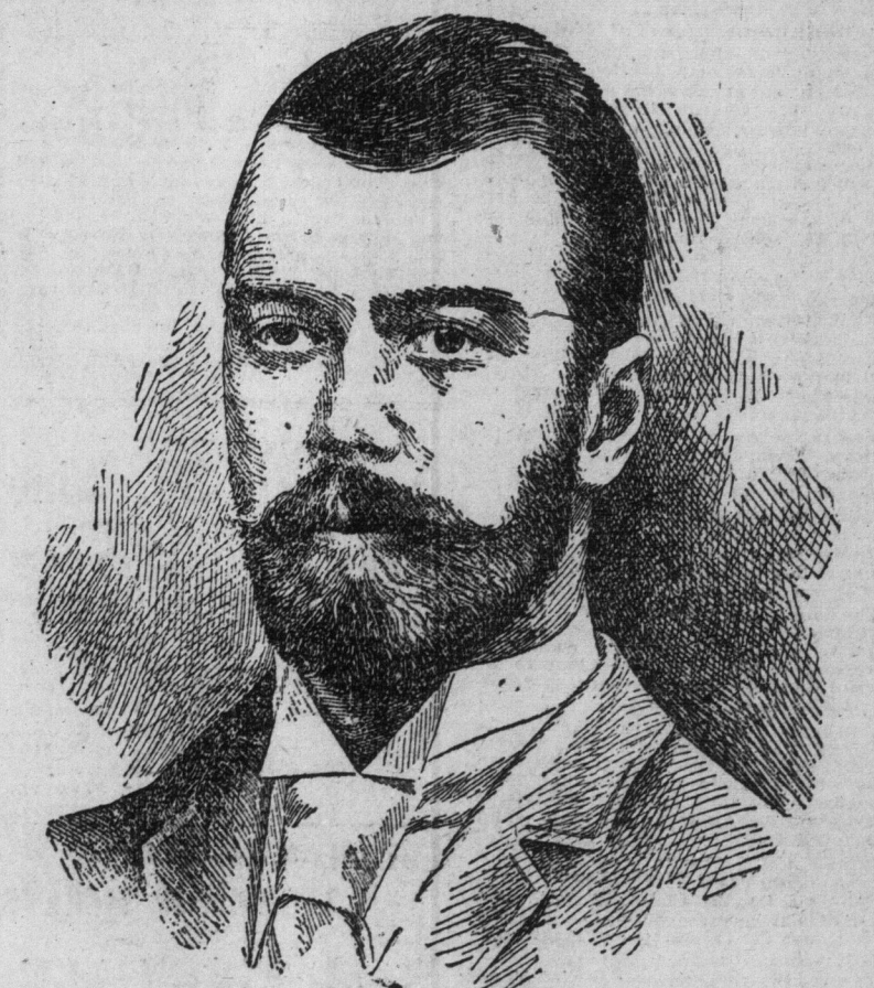
CZAR NICHOLAS OF RUSSIA.

A Gleaming Building. The building was a gleam of electric light