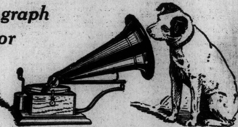
"HIS MASTER VOICE"

The variety of music and entertainment afforded by Victor Records is so comprehensive that one could play six different numbers every day for three years and not exhaust the complete assortment available. Victor Records run the whole gamut of vocal and instrumental reproduction by the world's greatest and best artists.