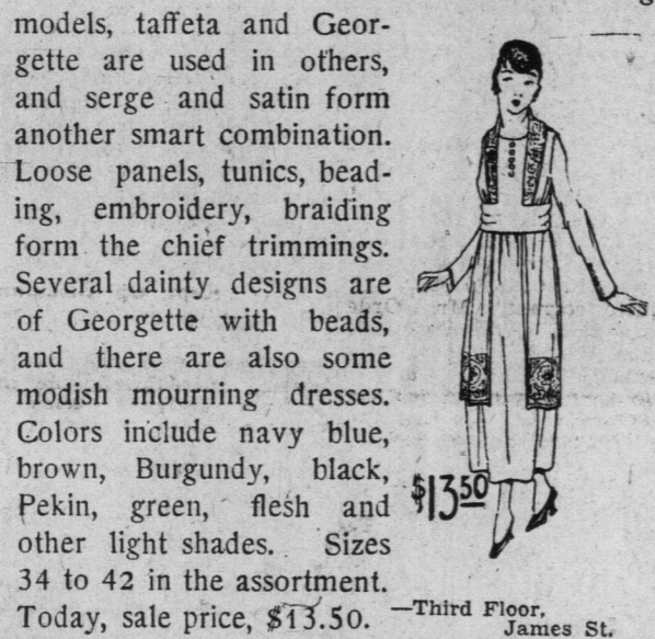
—Third Floor, James St.

Such fascinating dresses as these are seldom offered at so low a price! There is a great variety of designs and materials, and, being samples, there are not more than one or two of a kind. Several are of taffeta silk of fine quality, some trimmed with milk-white or colored beads, and others embroidered. Taffeta and velveteen are combined to make some charming models, taffeta and Georgette are used in others, and serge and satin form another smart combination. Loose panels, tuning, embroidery, braiding form the chief trimmings. Several dainty designs are of Georgette with beads, and there are also some modish mourning dresses. Colors include navy blue, brown, Burgundy, black, Pekin, green, flesh and other light shades. Sizes 34 to 42 in the assortment. Today, sale price, $13.50.