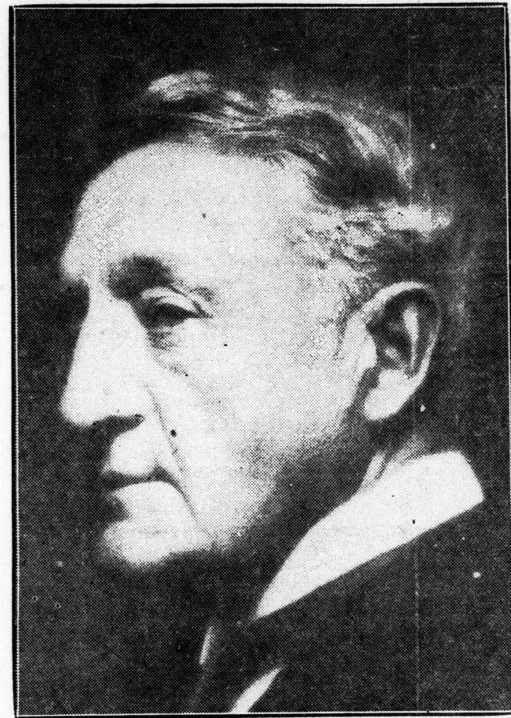
THE LATE SIR ADAM BECK Founder and President of Queen Alexandra Sanatorium

Death's intervention thwarted Sir Adam's decision to lead this campaign. Dying, he committed this great unfinished work to those he served—to YOU!