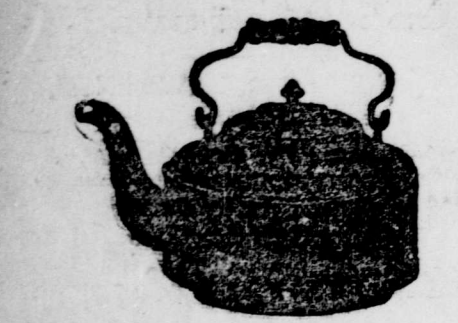
Graniteware Tea Kettles, pit bottom, to fit No. 8 stove, regular 85c, sale price 53c; to fit No. 9 stove, pit bottom, regular $1.00, sale price 65c.

One of the biggest, if not the biggest, events at this store during January will be a Special Sale of Graniteware. We have two carloads that will be sold at prices away below the regular. The sale commences next Saturday morning at 8 o'clock.