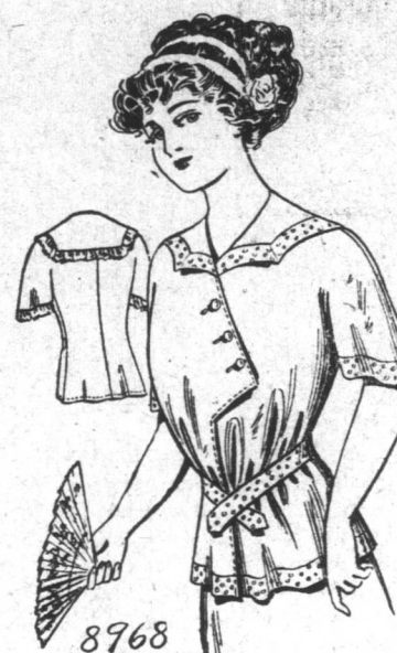
Ladies' Dressing Sack.

Side closings are as effective in garments of this kind as in shirt waists and gowns. This cool looking model is suitable for lawn, dimity, challie, cross bar muslin, crepe or silk. As here shown, white silk with trimming of blue and white dotted silk was used. The pattern is cut in 3 sizes: Small, Medium and Large. It requires 3 1/2 yards of 27 inch material for the Medium size. A pattern of this illustration mailed to any address on receipt of 10c. in silver or stamps.