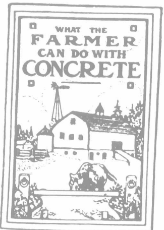
THIS book of 160 pages, handsomely bound and illustrated with photographs, was the first, and is the best work describing the farmers' uses for concrete ever published. See free offer on this page.

YOU should use “CANADA” Cement because its makers offer you not only the best cement made, but also careful, conscientious, personal assistance in making use of it.