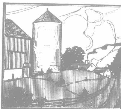
CONCRETE is the ideal material for barns and silos. Being fire, wind and weather proof, it protects the contents perfectly.

Concrete may be mixed and placed at any season of the year (in extremely cold weather certain precautions must be observed) by your-