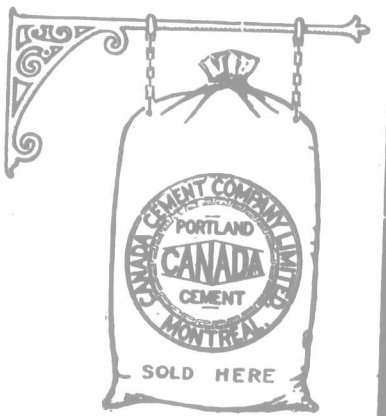
THIS sign hangs in front of nearly all our dealers' stores. Let it guide you to the place where the best cement is sold.

You can easily see why a company that is devoting this much attention to the farmers' needs is in better position to give you—a farmer—satisfactory service. Canada Cement will always give you satisfactory results. Every bag and barrel must undergo the most rigid inspection before leaving the factory.