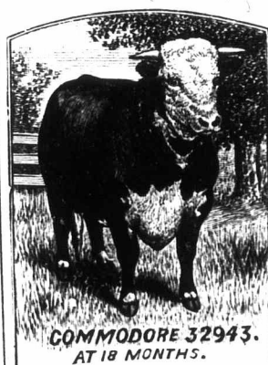
COMMODORE 32943. AT 18 MONTHS.