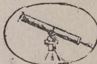
Registered Trade Mark.

Locks in all qualities for Cabinet Makers, Sash Fasteners, Locks & Brassfoundry for Builders' Ironmonger. ALL KINDS OF KEYS MADE on the PREMISES.