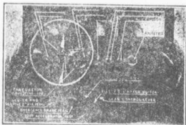
Illustration showing instrument Board on Chevrolet Four-Ninety. Electric starting and electric lighting switch, speedometer, electric horn, ammeter, oil indicator light equipment, gear shift lever. The Four-Ninety has selective sliding gear transmission with three speeds forward and reverse.