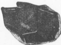
Showing robe rail, foot rest, door pockets and hand pads.