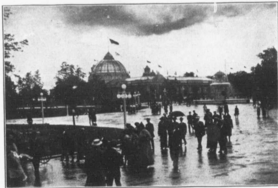
AFTER AN EVENING SHOWER AT TORONTO EXHIBITION.

"Except ye be converted and become as little children, ye shall not enter into the kingdom of Heaven." This shows us that Jesus loved children, and wanted them to be consecrated to His service while still in early life. Some of us in later years feel very keenly the debt we owe, and realize the utter impossibility of ever repaying. The greatest we have to give is our life—our life's service. When we come to this deep realization we are startled and we use our best endeavors for our Lord and Master; but we find ourselves untrained, and inexperienced with