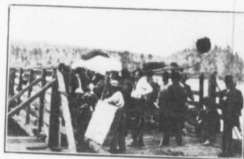
COMING IN TO MAKE HOMES