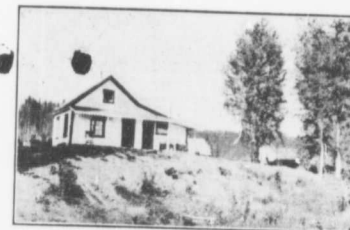
A SETTLER'S NEW HOME