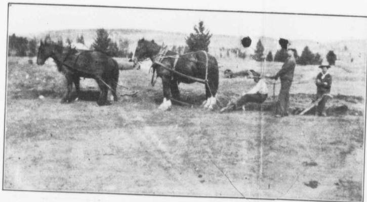
BREAKING UP NEW LAND