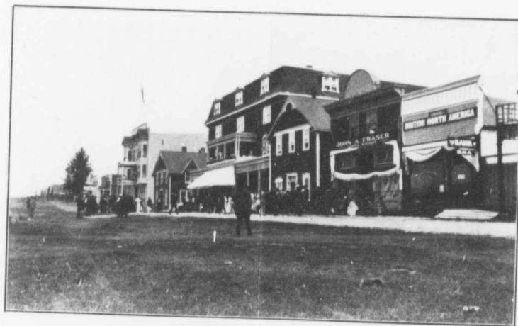
MAIN STREET TODAY. QUESNEL