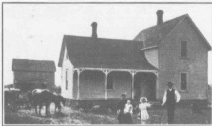
Newcomers Who Will Share Kent's Prosperity.

The town site, situated on Smith creek, close to the Thames, with the River Sydenham nine miles to the north, is well drained. Bothwell is one of the healthiest towns in Canada. Residentially, it is better laid out than most cities. Well kept lawns,