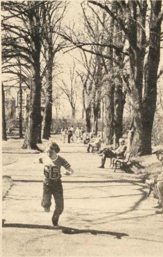
WHAT A TREMENDOUS TIME TO BE LIVING IN NOVA SCOTIA! There's a fresh spirit in the air. Our Province is growing, becoming as strong as it is beautiful.

Nova Scotians can see the results of John Buchanan's programs - the progress that's been made since the Buchanan Government came into office.