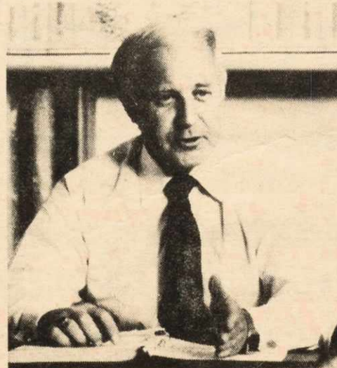
LEADERSHIP MAKES A DIFFERENCE. In his continuing negotiations on offshore resources and Federal-Provincial cost sharing, Premier Buchanan has been tough but flexible, working hard to get the best possible deal for all Nova Scotians. He's a leader with a plan for the future, and the experience to make it work.