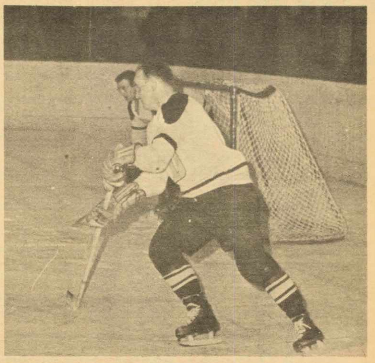
Dal Wins 8-2

The Quartier Latin will operate for two more weeks under the present staff while the Council tries to find a new group to operate the paper. When the new staff take office there will still be five issues to produce.