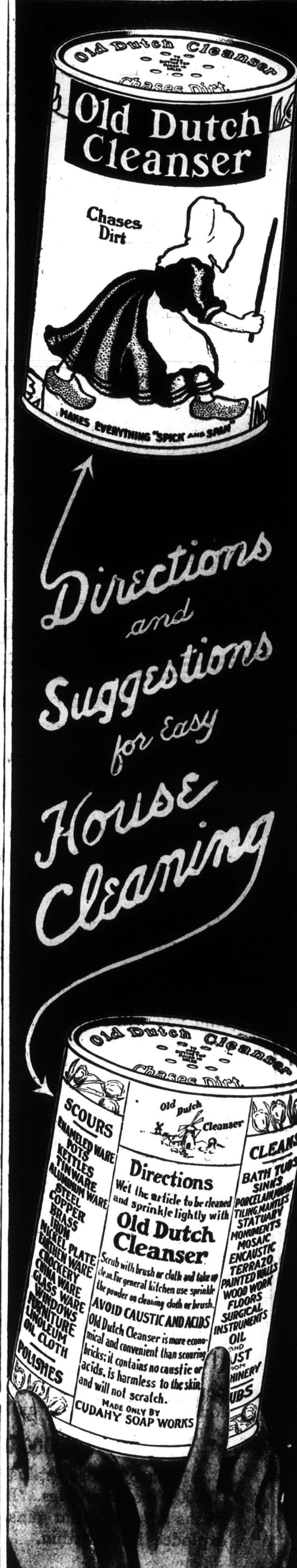
Write to The Cudahy Packing Co., Toronto, Canada, for our Booklet "Hints to House-wives."