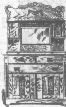
No. 506—Sideboard Elm, antique finish, top 18x46 in. One long drawer, two small drawers (one lined for silver) $10.75.