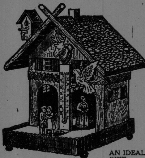
AN IDEAL GIFT

Coupon This Coupon and 69c Good for $1.00 Weather Prophet House