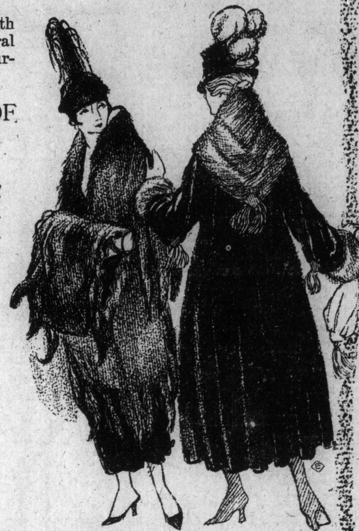
Cape scarf and round muff of Jap-Kolinsky (dyed weasel). Price, $102.50 set.