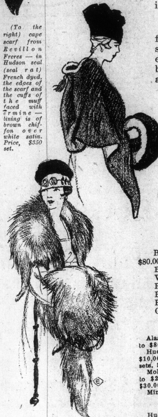
Animal scarf and round muff of red fox. Price, $120.00 set.

WHILE everything that goes into the manufacture of these machines has advanced in price, particularly in the past few years, only once in 20 years have we offered machines of this quality at so low a price. Think of it! Machines absolutely guaranteed for ten years, without any restrictions, for $22.50. You can buy one without hesitation, for we've handled the Eatonias machines for 20 years and know they are right. They are the popular drop-head design, have five drawers, bicycle ball bearings, so that they run smoothly and easily, and the cases are of golden oak. With each machine is a complete set of attachments, such as tucker, ruffler, hemmer, binder, braider, quilter, etc., in strong, plush-lined box. We will take orders by phone, mail or wire as long as the lot lasts, and deliver them free anywhere in the city, Ontario or Eastern Provinces. See these in Yonge and Queen street windows. Monday, go directly to Purchase Building—they are on the second floor. Remember, guaranteed for ten years. Extra special price, $22.50.