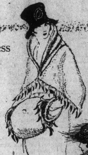
Caperine and round muff of ermine, with facings of chinchilla, squirrel, and lining of white satin and chiffon—a model from Revillon Freres. Price, $375.00 set.