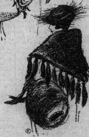
Cape and pillow muff of Alaska sable in "drop" skin, set, with natural tails. Price, $500.00 set.