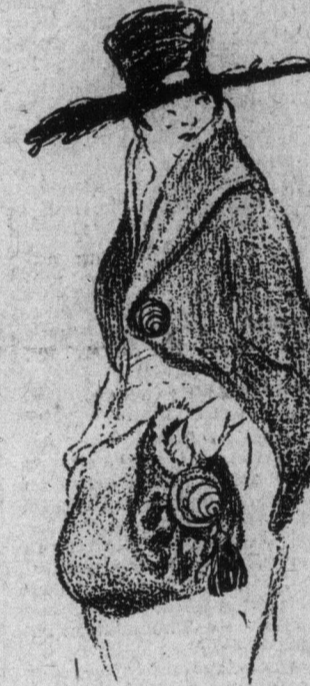
Cape of moleskin with ermine facings and lining of taupe chiffon—dog muff with tassels and pipings of ermine. A Revillon Freres model. Price, $375.00.