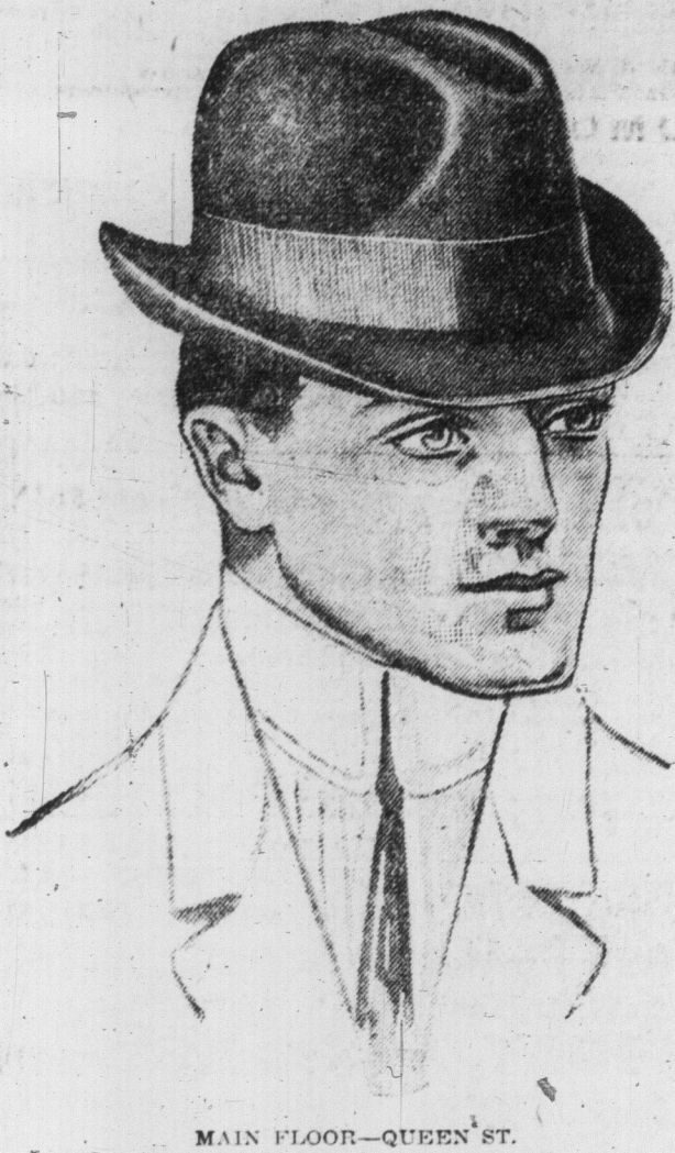
MAIN FLOOR—QUEEN ST.

We've prepared extensively to meet that demand. New styles, new finishes in the felt, new textures, new shades—a very broad assortment of new fashions.