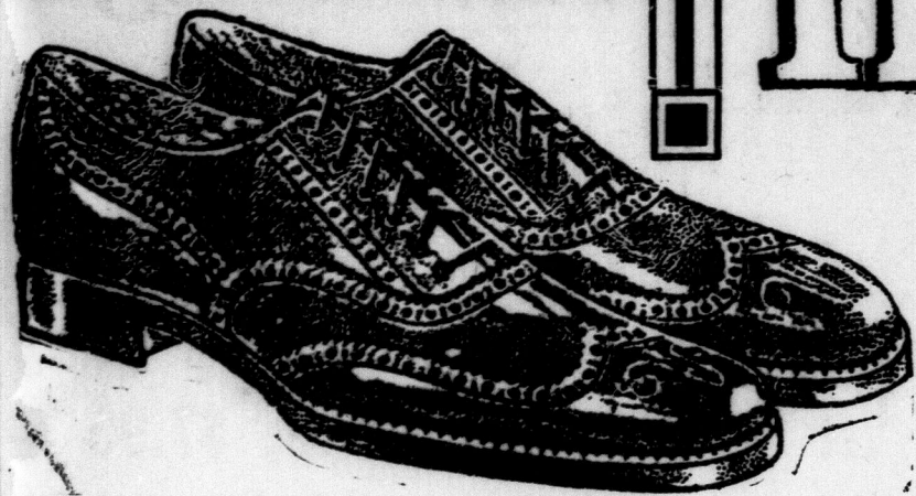
BROWN BROGUE OXFORDS, $2.93.

Sizes up to and including 4½. Clearing the remaining pairs of these fashionable, durable, Brown Calf and Brown Kid Oxford Shoes at $2.93