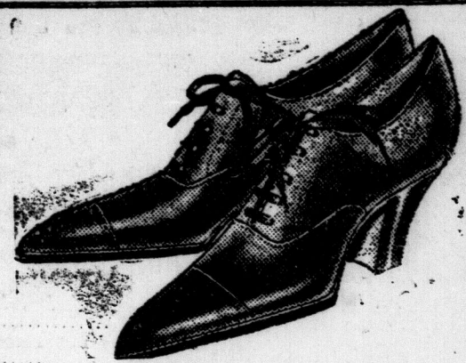
LADIES' COLORED AND FANCY BOOTS, $6.93.

Two lots of these. Lot No. 1—All size 3, made of Brown Kid with Cuban heels; $7.00 value. Lot No. 2—Sizes 6, 6½, 7, made of Brown Calfskin, with Neolin soles.