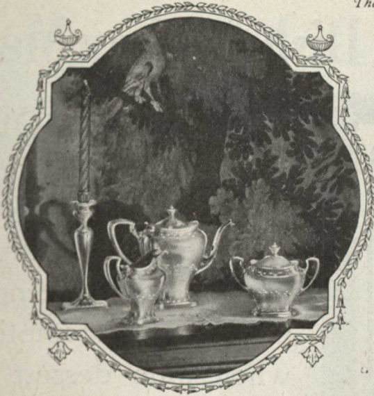
The Louvain Pattern