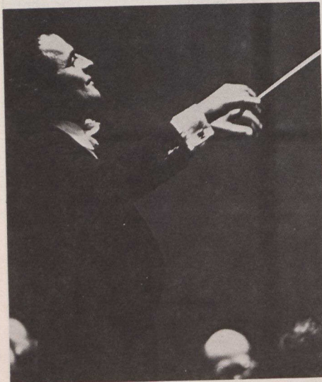
L'Orchestre symphonique de Montréal is conducted by Charles Dutoit.