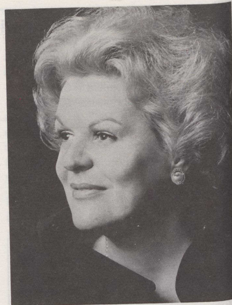
Contralto Maureen Forrester will perform with the Toronto Children's Chorus.